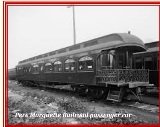
Pere Marquette Railroad passenger car

Railroads were also a major factor in Thomas Township's history. The Saginaw Valley and St Louis Railroad Company was organized in 1873 and it cut