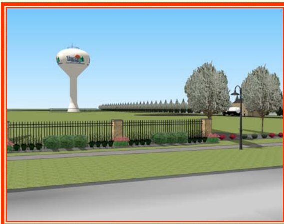
Engineers rendering of the water tower once it is completed