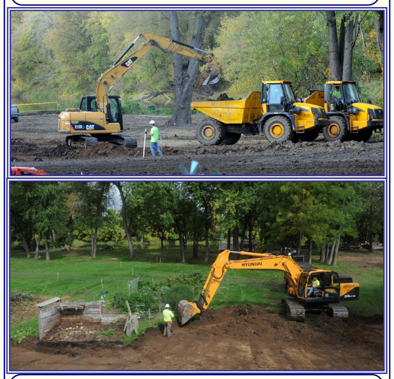
Soil is removed from about a dozen backyards along N. River Road south of Dice. The yards are in a floodplain along the Tittabawassee River. Dow Chemical was removing contaminated soil under the direction of the Environmental Protection Agency.

Construction crews excavate 12" of soil from about a dozen backyards along N. River Road south of Dice. The yards are in a floodplain along the Tit-tabawassee River. Dow Chemical was removing contaminated soil under the direction of the Environmental Protection Agency.