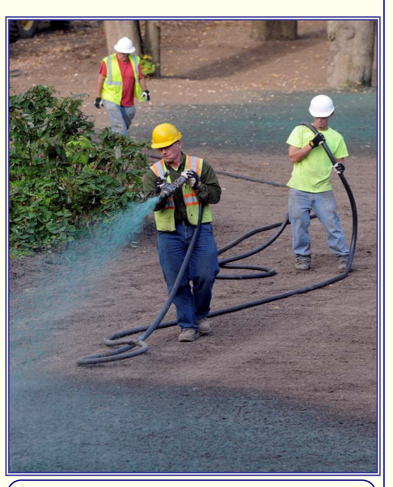
After 12" of soil was removed and replaced with clean soil the yards are seeded. About a dozen backyards along N. River Road south of Dice were involved in the project. The yards are in a floodplain along the Tittabawassee River. Dow Chemical was removing contaminated soil under the direction of the Environmental Protection Agency.