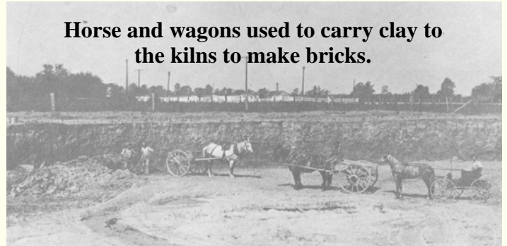
Horse and wagons used to carry clay to the kilns to make bricks.

In the 1920's there were three dairies operating in