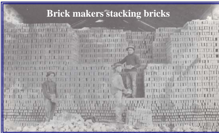
Brick makers stacking bricks

In 1872, Ferdinand Ohmer started a brickyard near the Tittabawassee River on what is now known as North River Road. The bricks were sold commercially and shipped down the river on barges to Saginaw. Ferdinand's operation was sold in 1895 to the Sperry Brothers who continued to produce bricks at this location until 1900, when they closed up this location and moved it to South River Road. Once the brothers moved to the South River Road location, they purchased a tile machine and switched from making bricks to making tile. The Sperry brothers sold their tile company in 1915 to the Miller City Tile company of Findlay, Ohio, who continued to produce tile at that site until 1941 when a fire devastated the site. The building's were never rebuilt and the land eventually sold. A couple of other brick companies were the Thomas Day Clay Pit and the John J Liskow Yard.