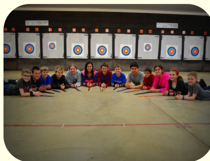
Previous Archery Class