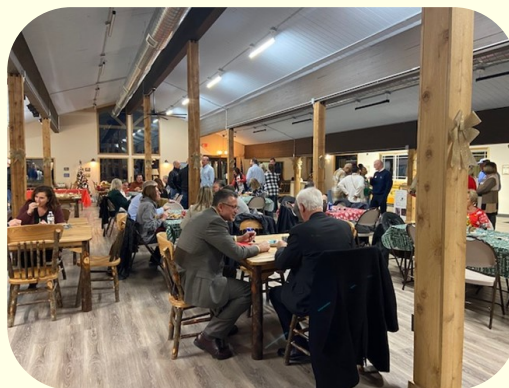
Thomas Township Business Association held their Christmas get together.