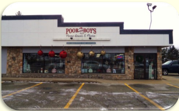
Poor Boy's Home Décor & More