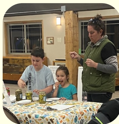
Pickle Tasting at a F.U.N. night event. Dill pickles were the favorite!