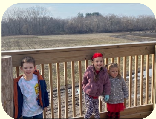
Our Little Acorns made it all the way to the observation deck!

We are in the early stages of our development, so we appreciate your patience as we grow. We hope that you keep coming back to see what is new and enjoy the nature experience that we provide.