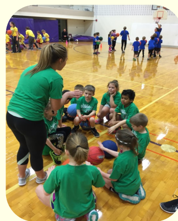
Basketball Clinic Coach with team

This six week program is held at Swan Valley High School and is for kids ages 4 - 8. Our recreational staff, which consists of high school athletes, will run the kids through skill drills that will help them take the next step in basketball. We also like to encourage the participants in the basketball clinic to attend the local high school games and cheer their instructors on as they play. The deadline to register was November 22nd with the clinic beginning on January 13th .