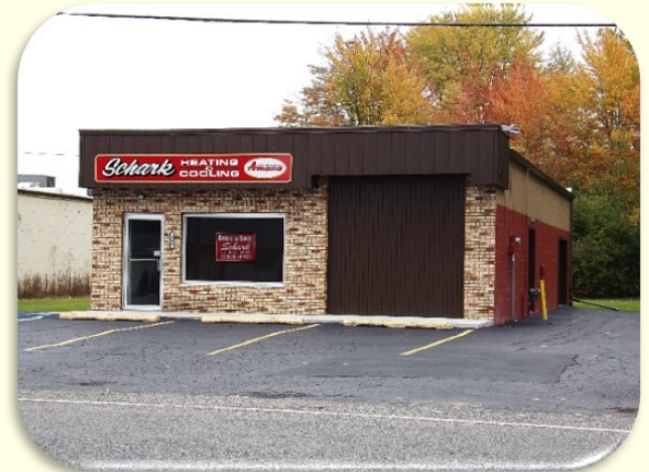
Schark Heating & Cooling, Inc.

Thomas Township has been the hub of a lot of their customer base for years. Many of their family members are graduates and current students at Swan Valley Schools. Thomas Township residents have always been supportive of their family business, and they're looking forward to being more centrally located for you to stop in to schedule an appointment, pick up a filter, or just to say hello. Visit their website at scharkhac.com for more information.