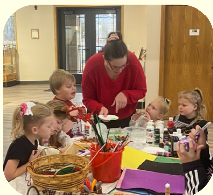
Young crafters create their nature/recycle-based Christmas crafts.