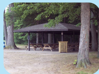
Roethke Park Pavilion

Starting January 2nd, 2024 at 8:00 am Thomas Township Residents Only can begin renting pavilions for the 2024 year. Pavilion rentals will open up to Non-Residents beginning in February. Make sure to get your reservation in as early as possible because the pavilions rent out fast!