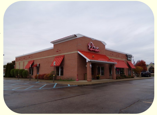
Pho Asian Bistro