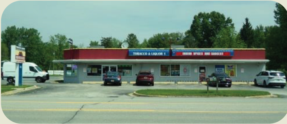
Tabacco & Liquor 1 and Indian Spices and Grocery