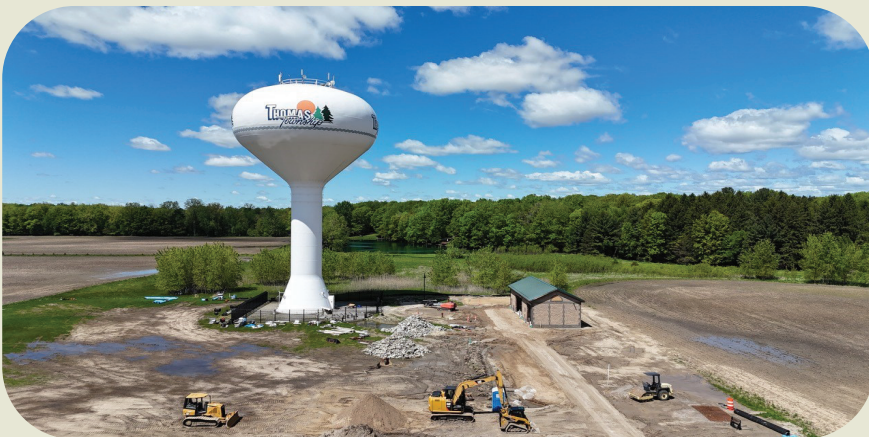
Water Booster Station

As always, if you have any questions or concerns with anything Public Works, please call the office at 989-781-6438, or you can email me at dpwdirector@thomastwp.org