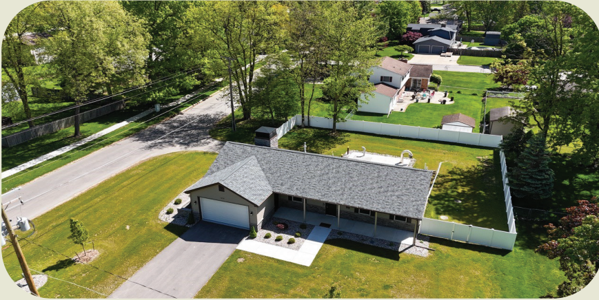
Pump Station #4