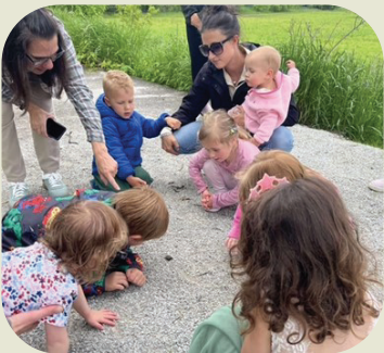
Our Little Acorns group went on a turtle hunt and we found a bunch, including this little one on the trail!

What's next? We are monitoring the native plants that were planted last year with the assistance of Chippewa Nature Center. We will follow recommended protocols to develop a flood plain prairie. Sunflowers will be back this year and should be looking good by mid - late August, depending on how the summer goes. Forty more trees will be added too. We are looking to develop an interactive loop in the preserve area closest to the building. A storybook trail, bug hotel, and serenity area are in the works. As we grow, we hope to add additional programs and opportunities for our community. If you have any questions or would like more information, contact Lynda at naturecenter1@thomastwp.org or call (989) 245-0801.