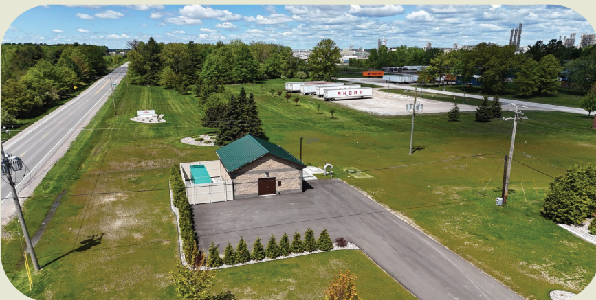
Pump Station #12

For those who have asked for an update regarding our construction efforts the past few years, please see these photos of Sewage Pump Station's #12, #4, #16, and the Water Booster Station under construction at the water tower. These improvements were required to support industrial development on the west side of the Township.