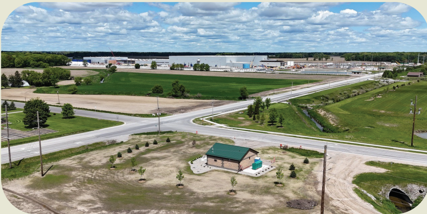
Pump Station #16