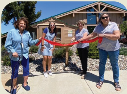
The ribbon cutting ceremony with members of Altrusa, who donated funds for the Little Library and additional supplies.