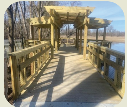
The bridge on the west side of the preserve is finished, but will be closed for the Great Blue Heron baby season.