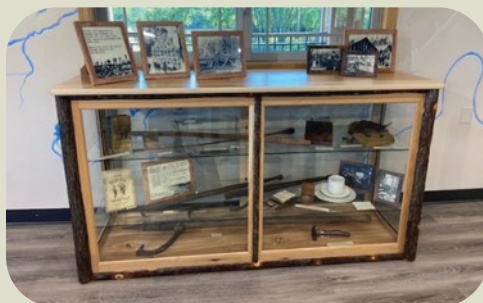
A revamped display of logging artifacts.