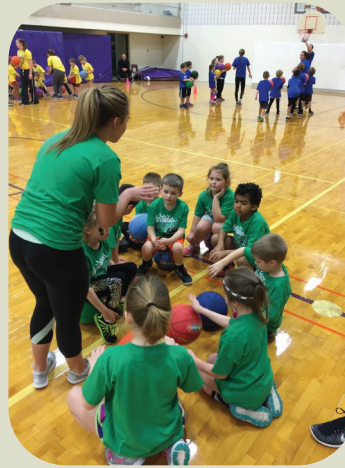
Basketball Clinic Coach with team