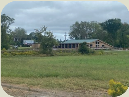
A view of the preserve plantings and the Nature Center.