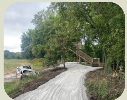
The new gravel trail at the observation deck.