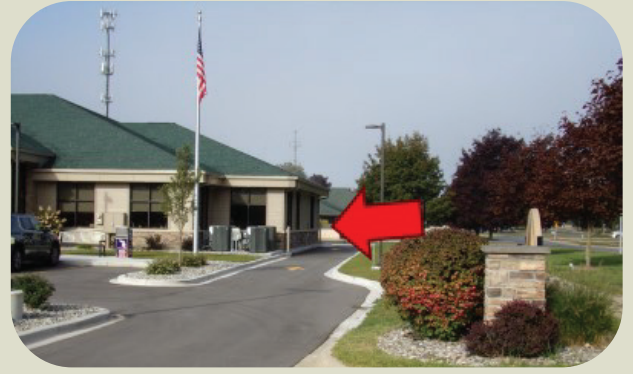
Drop Box Location

Here's how it works: The drop box is situated flush against the wall on the north side of the building. To use it, simply push up on the handle to open the box, then pull down to securely close it. Once you've placed your payment inside, it will safely enter our locked deposit box within a secure room, where our team will process it the following business day.