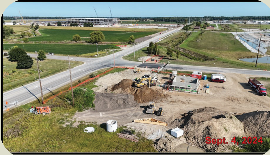
Pump Station on Geddes/Gleaner

Additional work will be completed on the water system beginning this fall and continuing through next spring. The majority of the work will be completed at the water tower site on Graham Road, but additional isolated water main work will also occur. Any work that will require a shutdown will be accompanied by advance notice from this office as to minimize the impact on our residents.