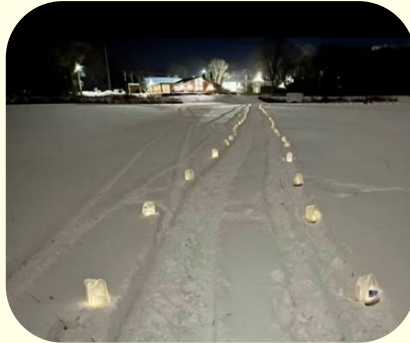
A serene view of the Nature Center during our Valentine's Day Luminary Hike