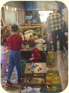
Visitors enjoying a Saturday Family Fun Day

In the Nature Center, we are open Tuesdays 3-7 pm, and Wednesdays - Fridays from 12-4 pm. We offer F.U.N. (Families United in Nature) from 5-7 pm on Tuesdays and Little Acorns Preschool Group from 1-2 pm on Thursdays. Both programs are based on a weekly theme and have multiple activities and a snack. Every Wednesday from 12-2 pm is reserved for adult visitors and we are open the first Saturday of the month from 10-2 pm for our Family Fun Days. On two Saturdays this year, it will be held on the second Wednesday, May 10th and July 12th. We will be adding some programs and open hours to our schedule. We are planning to add three Nature Discovery Camps this summer for 8 - 11 year olds. Each camp has a theme and a culminating project in the nature preserve. Check out our Facebook page or the Thomas Township website for the latest news. We are excited to continue growing and are thankful for the support of our community! For more information, contact the Nature Center at (989) 245-0801 or email naturecenter1@thomastwp.org .