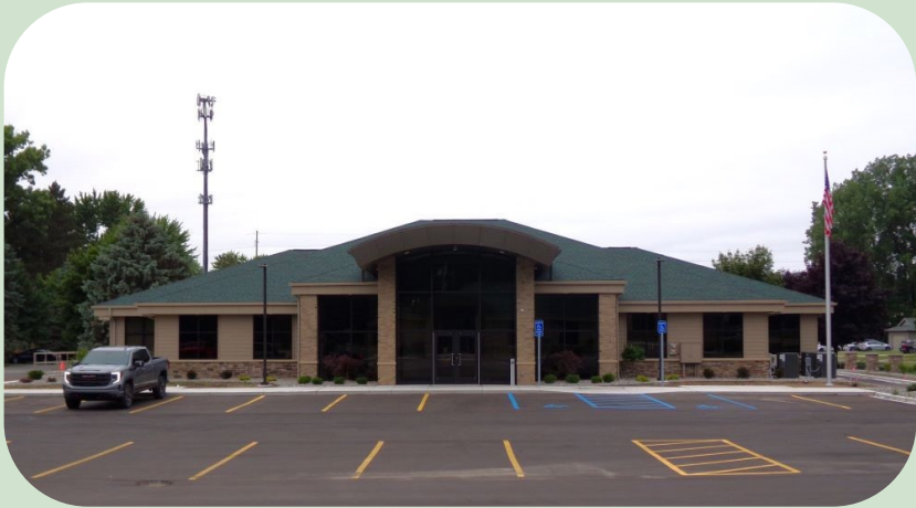
New Township Municipal Office

Due to circumstances beyond the Township’s control we had to change the dates of moving into our new building. The new scheduled dates of moving will be Thursday, July 18th and Friday, July 19th. We will be closed those two days for moving and set up and will reopen on Monday, July 22nd. We are beyond excited to get into our new building.