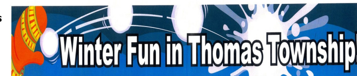
Proposed Township Winter Banner

banners informing the public of activities that are part of the Parks and Recreation programs at Thomas Township.