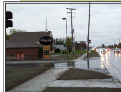
New sidewalks/landscaping in front of 7877 Gratiot.

2011 saw many improvements to the Gratiot Road Corridor. The construction of a new twenty (20") inch water transmission main was completed along with many improvements to properties along the south side of Gratiot Road. Several curb cuts were closed