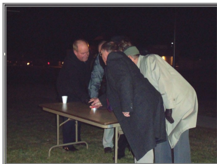
Members of the DDA Board Switch on the Street Lights.