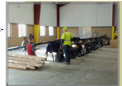
Employees of J. Ranck Electric assemble new lights.

A great deal of thanks is owed to the contractor who did the work, J. Ranck Electric. J. Ranck was the low bidder with vast experience with installing streetscape lighting throughout Michigan. Standard Electric was the low bidder for all of the electrical equipment used from the underground wire to the light poles and banner arms. It was a pleasure