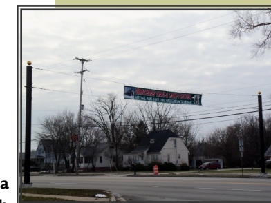
Over-the-road banner between Swanson and River