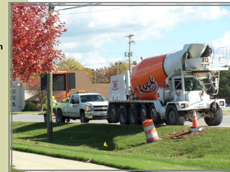
J. Ranck Electric install footings for lights.

As I am sure all of you have noticed by now, the Gratiot (M-46) street light project is complete. A total of ninety-eight (98) lights were installed. From the many comments, this has been a great success which will have lasting benefits for the business district as well as the entire Thomas Township Community.