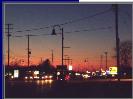
Gratiot Road Before Lighting Ceremony

On January 9, 2012, the "switch" was flipped at a ceremony hosted by Stanley Steemer to light up the newly installed streetlights along Gratiot Road. With help from the Thomas Township Business Association, the Thomas Township Development Authority (DDA) installed ninety-eight (98) streetlights beginning the late fall of 2011 with comple-