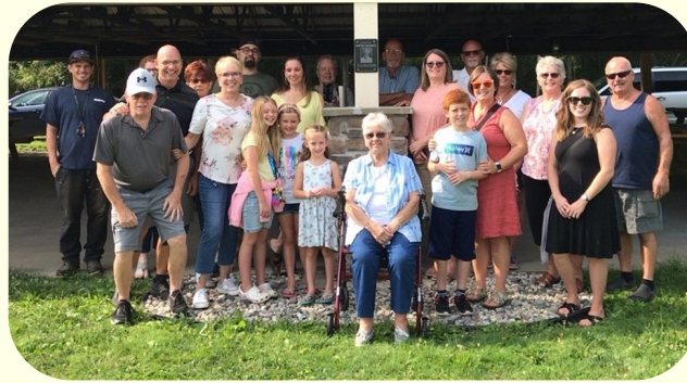
Members of the family pose with the new plaque.