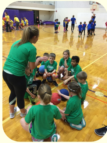
Basketball Clinic Coach with team