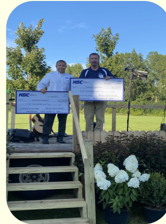
HSC Donation to Parks & Recreation

The Parks & Recreation Department depends on the work of so many people in our community who volunteer to coach, work events, help raise money or give back to their community in other ways. We would like to take this opportunity to thank everyone who has donated to the Parks and Recreation Department throughout the year and specifically thank everyone who donated towards the Evening in the Park Fundraiser: