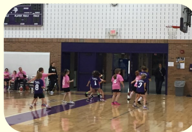
Girls Basketball at S.V. High