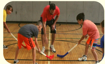
Floor Hockey; Face Off

Floor hockey is back again this year for grades 1st-3rd. This will be an instructional program with coaching and officiating provided by Thomas Township staff. There won't be any practices for Floor Hockey. Kids will learn the basics of the game and be able to put their skills to the test for 6 weeks beginning the third week of February. Games will be held on Saturdays. Mouthguards are required to be worn by all participants. Stop into the office at 249 N. Miller Road to register or if you have any questions. Registration is now open and will close the last week of January.