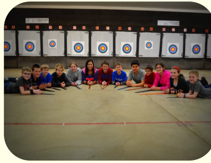
Previous Archery Class

All archery classes are six week programs that are taught every Thursday. Students learn about recurve, compound and cross-bows. Instructors are certified through USA Archery and the National Field Archer's Association (NFAA).