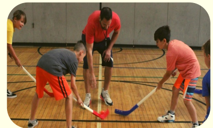
Floor Hockey; Face Off