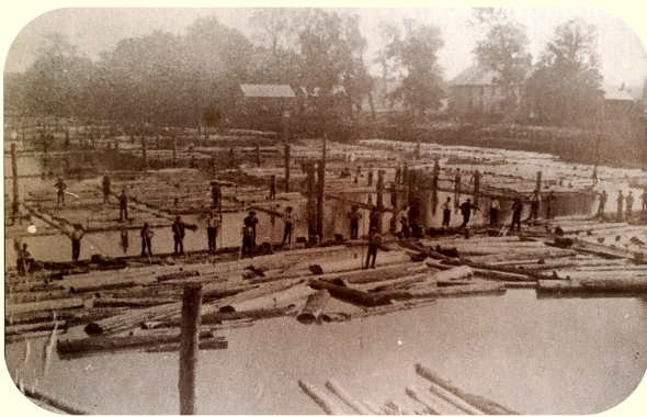
Tittabawassee Boom Company; men working on the Tittabawassee River

Thomas Township’s first known business was the Tittabawassee Boom Company, founded in 1864. It quickly became the largest of its kind for approximately 30 years. The Boom company was owned by many over its time. In its heyday the company controlled 12 miles of booms down the Tittabawassee River. This was at a time when there were around 100 sawmills lining the banks of the river.