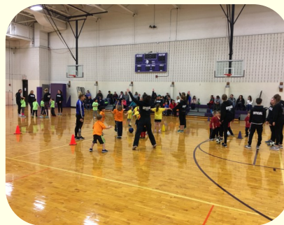
Previous Soccer Clinic