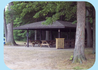
Roethke Park Pavilion

Starting January 5th, 2026 at 8:30 am Thomas Township Residents Only can begin renting pavilions for the 2026 year. Pavilion rentals will open up to Non-Residents beginning in February. Make sure to get your reservation in as early as possible because the pavilions rent out fast!