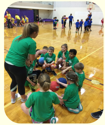
Basketball Clinic Coach with team

The Nature Center has new operating hours. Open 2pm – 8pm Tuesdays and Thursdays, 10am – 4pm Wednesdays and Fridays. The first and third Saturday of the month the Nature Center will be open 10am – 3pm. Moving forward with programs, Little Acorns and Families United in Nature (F.U.N) are still being held. There are no set repeating times and days for these events at this time. The dates and times might look different depending on the week. Check the Thomas Township website, under departments you will find the Nature Center & Preserve. There will be a calendar posted with the events for that month. You can also follow the Thomas Township Nature Center & Preserve Facebook page for updates and posts.