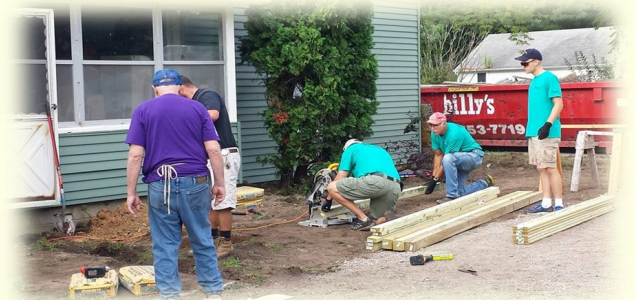
Thomas Township working with Habitat for Humanity 2017