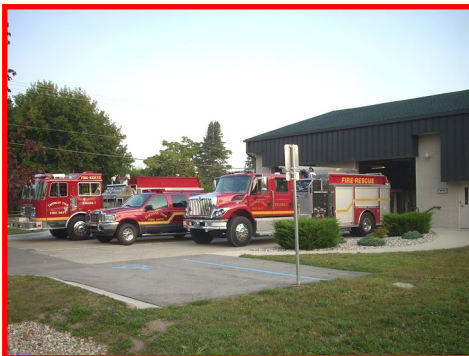
Thomas Township Fire and First Response Vehicles