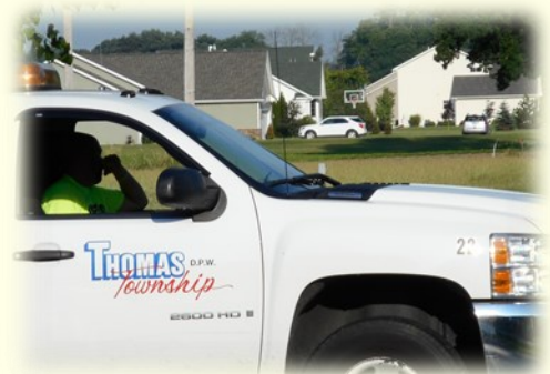
Thomas Township Department of Public Works Truck

If you experience sewer problems and cannot clear your drains yourself, there are numerous services available. Simply check your local phone directory under "Sewer Cleaners". If you believe you are experiencing problems with the Township's sewer system, please contact us immediately at 781-0150 or any time after normal hours at (989) 529-0041 and one of our staff will assist you.