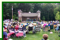
Concert in the Park Series at Roethke Park