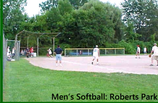
Men's Softball: Roberts Park