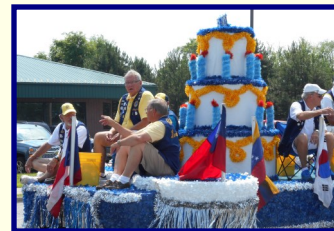
Lions Club Float: 2014 Lions Club Parade

The Parade will kick off a Car Show held at Roberts Park that is sponsored by the Lions Club. There is the possibility of more fun activities as well. The Entrance fell will be $10 to enter your car in the show and there will be chances to win prizes during the day.