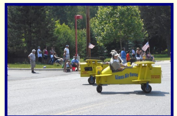
Lions Club Mini Planes: Lions Club Parade 2014