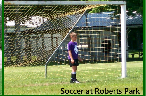
Soccer at Roberts Park