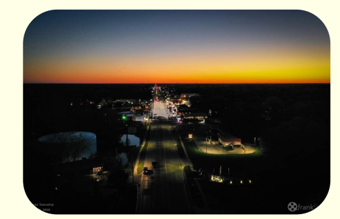
Overview of Gratiot Road in Thomas Township, evening of May 20th.

The bridges and roads are still closed, residents still can not enter their