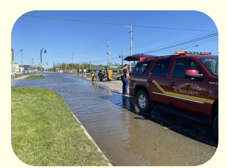
Fire Department responding to flooding.

I'd like to share the impact this year has had on your local first responders and how amazing they really are. As COVID-19 began, it forced us to re think how we operate as a Fire Department. We had to make some significant changes without negatively impacting on the service we provide you, our customers (residents). We modified how many responders would respond to calls and how many would interact with the patient or homeowner. We reduced the amount of times our members interacted with each other to include on-line training and limited exposures to people. We had to put a stop to the smoke detector installation program and limit fire inspections to high risk occupancies and significant life safety issues. As with many others, our Personal Protective Equipment (PPE) grew to include N-95 masks on all calls to gowns and an increased amount of sanitizing once the call was over. A challenge we were confronted with was; our at-risk responders themselves. Some met the criteria established by the CDC which prevented some of them from interacting as much as possible. We also had some who cared for family members who were very high risk which put them and their families in jeopardy. We worked together to limit those concerns. We continue yet today with the implications of COVID-19 and adjust our operations to be cautious but still serve our community to the best of our ability.