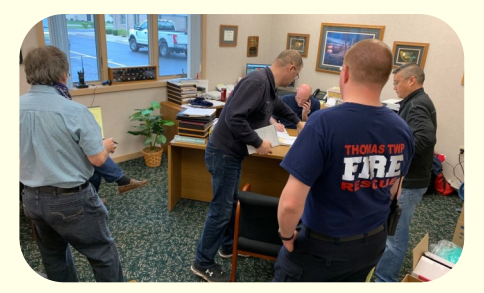
Command Post at Thomas Township Public Safety Building.

The failure of the Edenville Dam prompted the Thomas Township Department of Public Works, The Fire Department and everyone in the area had to go into overdrive preparing for what was to come. Evacuating residents, sandbagging, you name it, they were on it. Roads and bridges were being closed, and an eerie tone set into the Township Tuesday night while we all waited to see if Sanford Dam would hold. Evacuation shelters were set up at Swan Valley High School, Hemlock High School and Freeland High School for residents who needed a place to stay and wait out the flooding. Midland County Emergency Management confirmed that the water was flowing over the earthen berm part of the damn, but it held and stood strong to the waters. This still left water continuing on down towards Midland & Saginaw Counties.