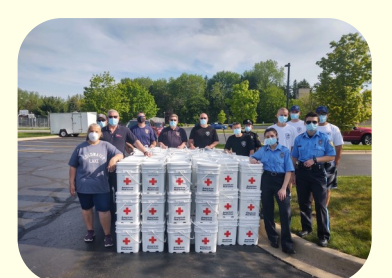
Red Cross Disaster Cleaning Kits to be distributed to homes.

What I found out though, when it came down to it, residents helped each other out, the community came together in a unity only a tragedy could bring. Businesses also came through to donate items and/or their employees to help move damaged items from the houses. Volunteer groups like Pay It Forward held several giveaway days and also supplied manpower to take away items from the affected homes. This restored my faith in humanity. This is why I love living in Thomas Township and why I love working for the residents of Thomas Township. Let's pray that we get back to what we believe is "normal."