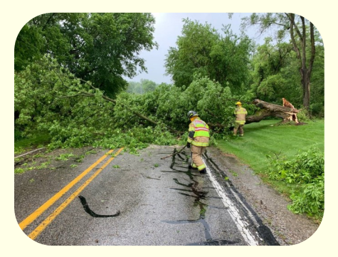
Fire Department clearing storm debris

Then, just as we were recovering a little from the flood, we had a wind storm hit our community knocking out power to the majority of our community. Our Fire Department had 32 calls in a two hour time period that evening. We had fire fighters, DPW workers and Parks employees cutting trees up that had fallen across roads. Our crews in combination with the Saginaw County Road Commission and Consumers Energy were able to make short work of the trees. Electrical services were restored over the days thereafter by Consumers Energy, but our DPW team kept the sewer system operating and the water running with generators.