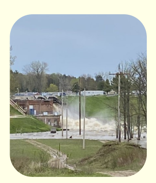
Edenville Dam Break

At 6:50 am on Tuesday, Midland County Emergency Management determined that both Edenville and Sanford Dams were at this point structurally sound, however, they would not be able to contain the onslaught of rising water through the spill gates. Throughout the day, officials were evacuating residents and businesses, watching the dams, and making plans as fast as they could.