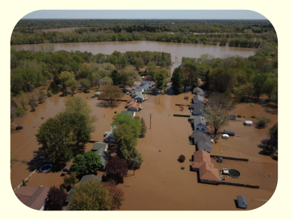
Wallace Drive

neighbors and organizations donating time, money and resources to affected families.