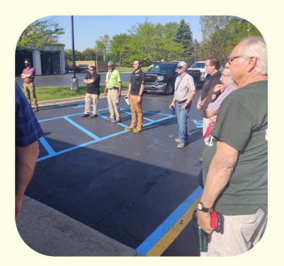
Flood damage team

nario that had been calculated, and with the heavy rains preceding it, no one could accurately calculate just how much water was behind the dams. Thus, with the help of the GIS Authority, we created a map that had expected flooding at 500 year marks. This map was then distributed to Fire, Police and Parks personnel who literally went out door to door to inform homeowners and business owners of the impending flood and to encourage them to evacuate. That same evening, plans were made for housing displaced homeowners and even for the eventual debris removal that would be a consequence of the event. Normally, we would have received help from support agencies like the Red Cross, but all of them had committed their resources to the Midland area already and the bridge closures prevented them from getting to us until much later.