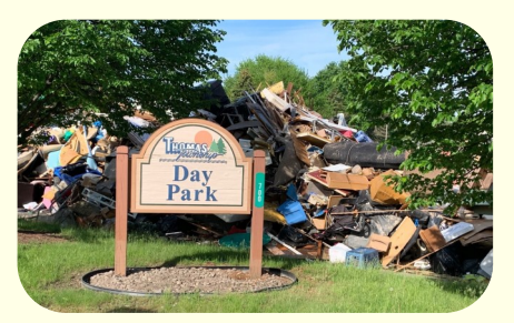
Day Park overflowing from flood items

It was a short lived relief when the river peaked and we learned it wasn't going to be as bad as it was predicted to be. However, that relief soon turned into heartache while I was driving through the neighborhoods and seeing all of the damage left in the wake of the flood. Piles and piles of residents' belongings put to the side of the road to be discarded. Life long memories, heirlooms, keepsakes, etc. damaged by the water now unable to be saved. Items that may have no monetary value but have sentimental value that is unreplaceable. I've heard stories from residents about losing everything; stories from residents having problems getting the needed assistance from their insurance company.