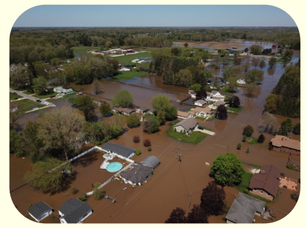
S. River Road Flooding

Back in May, the east side of our community was devastated by the enormous rainfall in the area and the failure of the dams on the Tittabawassee River upstream from here. Roughly 400 homes were flooded with river levels reaching 500 year flood stages exceeding even the 1986 flood event. It was the worst flooding this community has experienced in living memory. Upon being notified that the dams had failed, all of our staff went to work preparing for the disaster that was sure to happen. No one knew just how severe the flooding would be or how quickly the waters would arrive at that point, since this was not a sce-