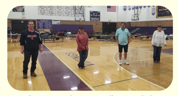
Volunteers at the Swan Valley H.S. Shelter

At one point we were told to prepare for something greater than what we experienced in 1986. For many of us we knew it was going to be a long night and the following day would reveal much devastation. Included in this evacuation was St. Francis Home. We, along with their staff and MMR moved all of the patients to the Swan Valley Middle School which served as the shelter site for them. The Swan Valley High School was then opened up as a shelter site for all other residents and evacuees. (Thank you, Swan Valley Schools, for your support!).