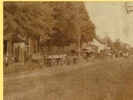
Photo of Thomas Township circa 1890