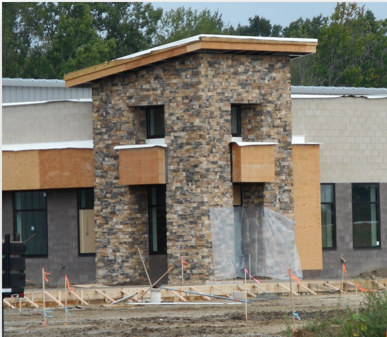
The new Fullerton Tool West Building.

If you know of a business interested in becoming part of the Great Lakes Tech Park, please contact Saginaw Future (on behalf of Saginaw County EDC) at (989) 754-8222.