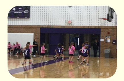
Girls Basketball at S.V. High

Our girls basketball leagues are offered for 2nd—4th grades and 4th—7th grades. Children in 4th grade can play up or down. Registration for girls basketball opens in December and ends on January 7th. There will be a draft held for the 4th—7th grade division at the Swan Valley High School. All kids will be assigned a coach who will set up practices during the week.