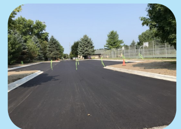
New Road between the Library and Main Office

The courts are a popular attraction all summer long, and so are the ice rinks during the winter. The new addition to the campus will provide parking closer to these areas while also keeping traffic flowing easily throughout the campus.