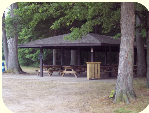
Pavilion at Roethke Park