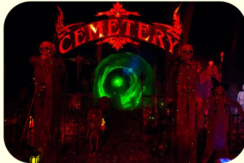
Haunted Train Ride Scene

Goblins, ghouls and ghosts oh my! It's that time of year again! Come and check out the Haunted Train Ride and Haunted House at Roethke Park, located at 400 Leddy Road, this October. Get your fill of fright from one or both attractions on October 11th - 12th or October 18th - 19th. The train of terror starts at dusk and continues until approximately 11:00 pm. There will be concessions available.