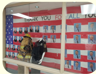
Display for First Responders