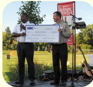
HSC Donation to Parks & Recreation