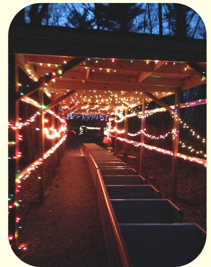
Festival of Lights

The Christmas Train and Festival of Lights is a fantastic family holiday event, sponsored by the Thomas Township Parks & Recreation Department. This event couldn't be done without the help of local businesses, organizations and families who come out to decorate a Christmas Scene for you to enjoy!