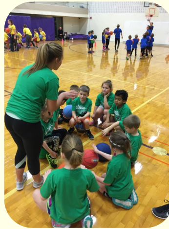
Basketball Clinic Coach with team