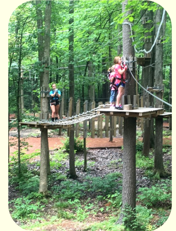
Day Camp at Roethke Park

*All children must be registered and paid in advance for this service.*