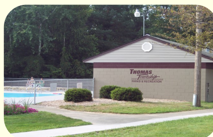
Roethke Park Pool & Pool house