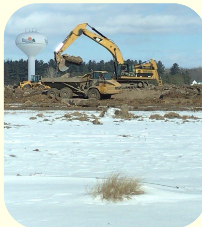
Construction underway at new SCE Facility

This project is just the beginning for Saginaw Control and Engineering, they also have options for space to build up to three similar sized additions in the future. The building permit for this project was issued to Pumford Construction in February of 2019 and they have already began work on the new building. It is projected that the construction of this project will take about ten months to be fully completed.