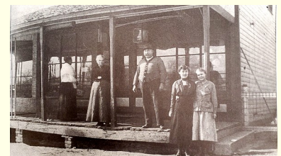
Early 1900’s photo of people gathered at Meade’s Hall

Before supermarkets and hotels, there were country stores. These smaller stores were the bustle of the neighborhood and Meade’s Hall was no exception. The hall was one of the most multi-purpose places in Thomas Township back in the early 1900’s. Meade’s Hall was perched at the corner of Frost & Lone Roads.